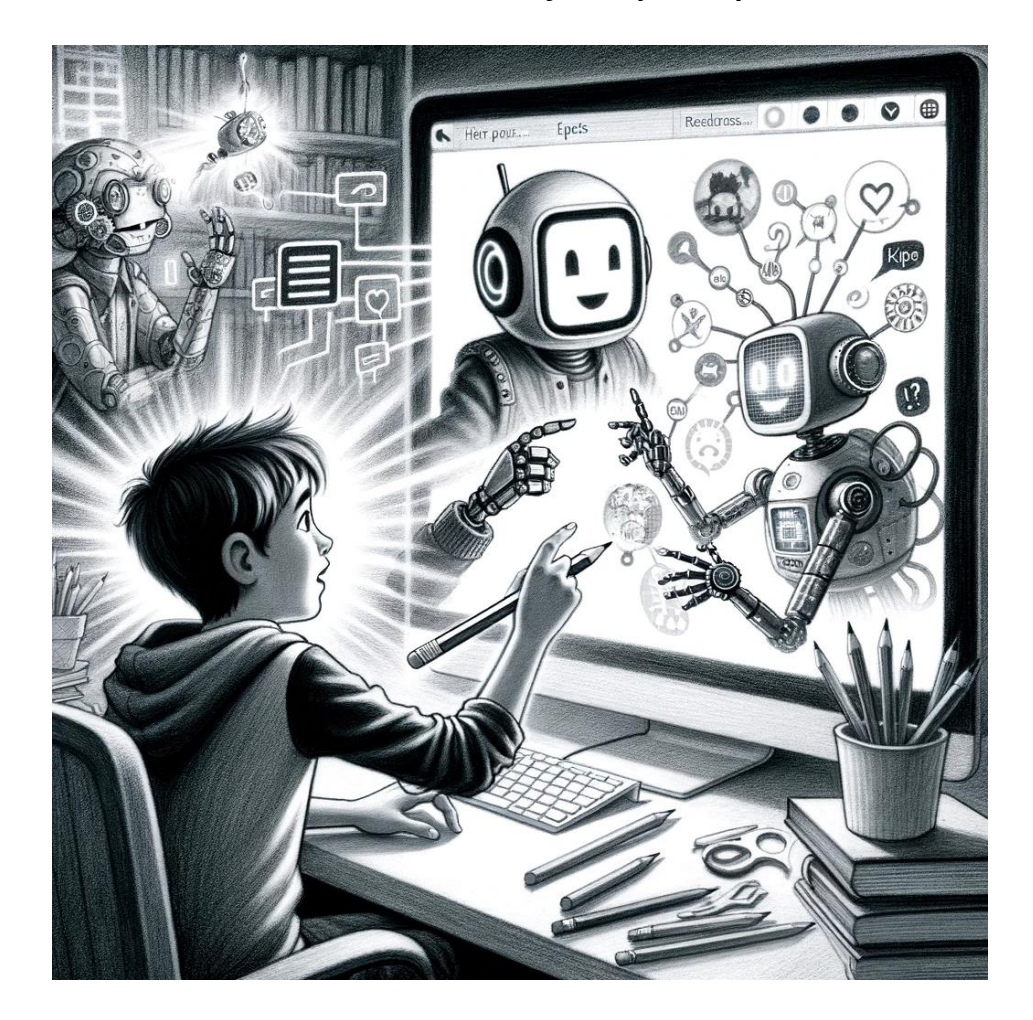
Part 2: The Fusion of Ideas

In the digital realm of circuits and creativity, Lachlan, Chatty, and Middy gathered around a glowing screen, their excitement palpable.